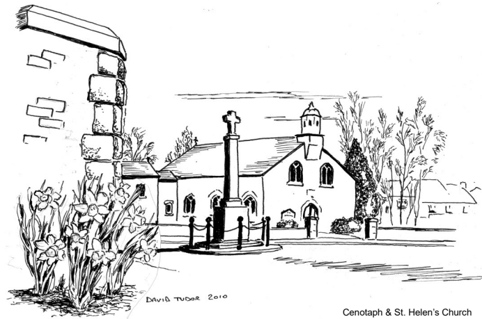
Cenotaph & St. Helen's Church

6 In 110m ignore path to right that crosses the field and keep straight on following the fence line. In a further 60m ignore the waymark pointing left for the path that crosses the hedge line and continue on the path bearing to the right towards the scout houses on Dam Lane.