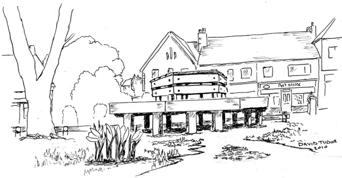
Glazebrook Village Green

3 Turn right and proceed up Dam Head Lane. After crossing the railway bridge continue on the lane around the bend before turning right down Bank Street and crossing over the railway once more. Continue down the length of Bank Street, passing the disused military camp on your right, for 800m. Just before the junction with Glazebrook Lane enter Glazebrook Village Green through a wooden gate on your right hand side.