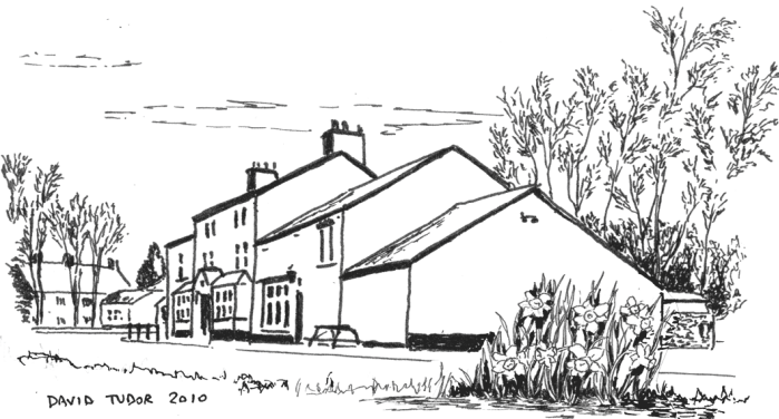
The Black Swan

⑨ At Hollins Green Scout Centre follow path between fenced gardens to emerge onto Manchester Road. (If required, the Village Community Shop and Cafe is a short distance to the right.) Turn left down the road passing The Black Swan public house on your left and the Community Hall on your right to return to the lay-by at the start of the walk.